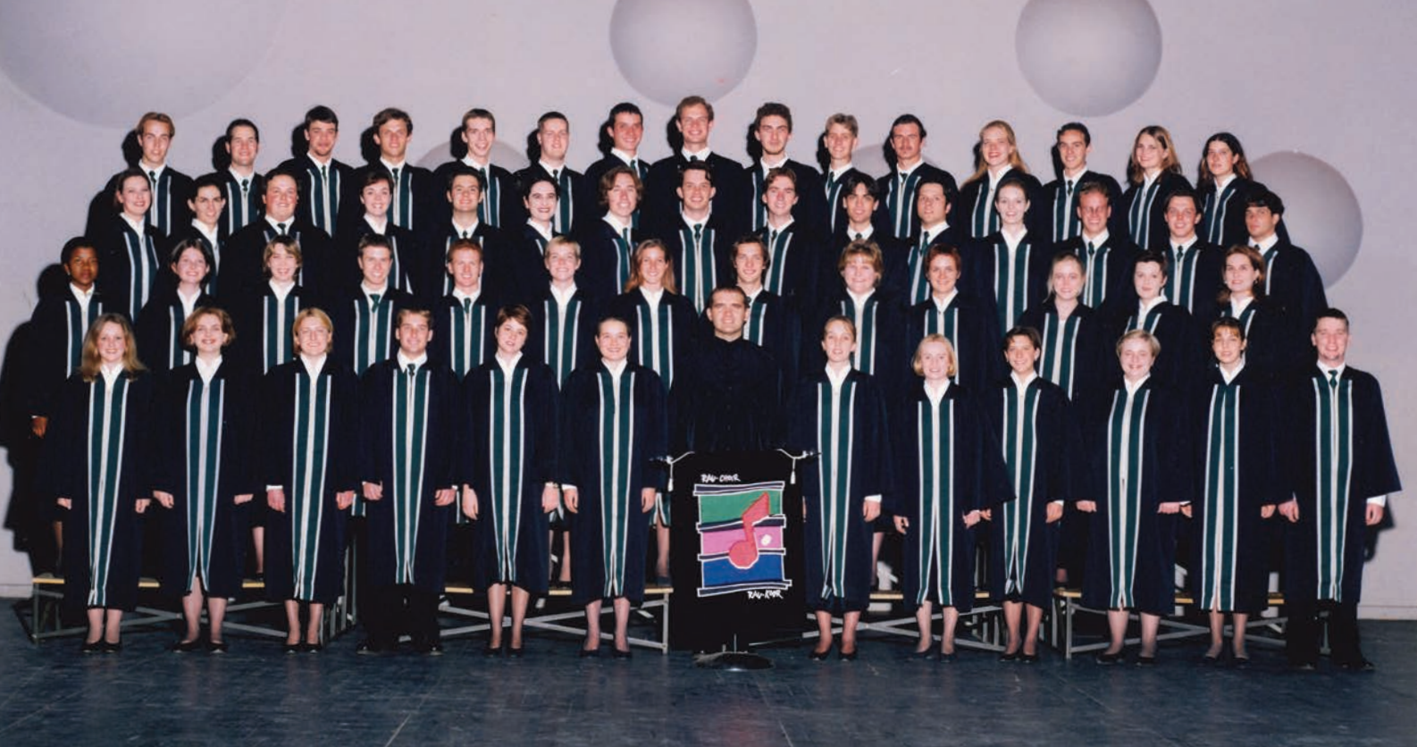
RAU Choir 1998