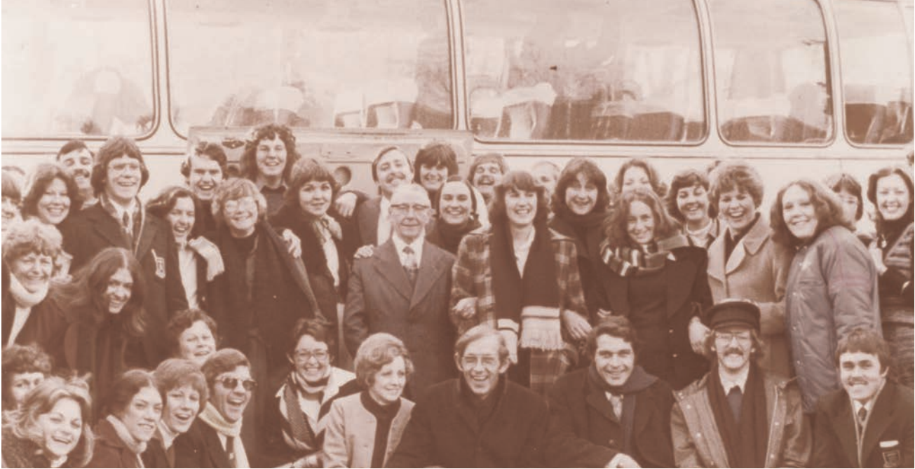
RAU Choir in Belgium 1978