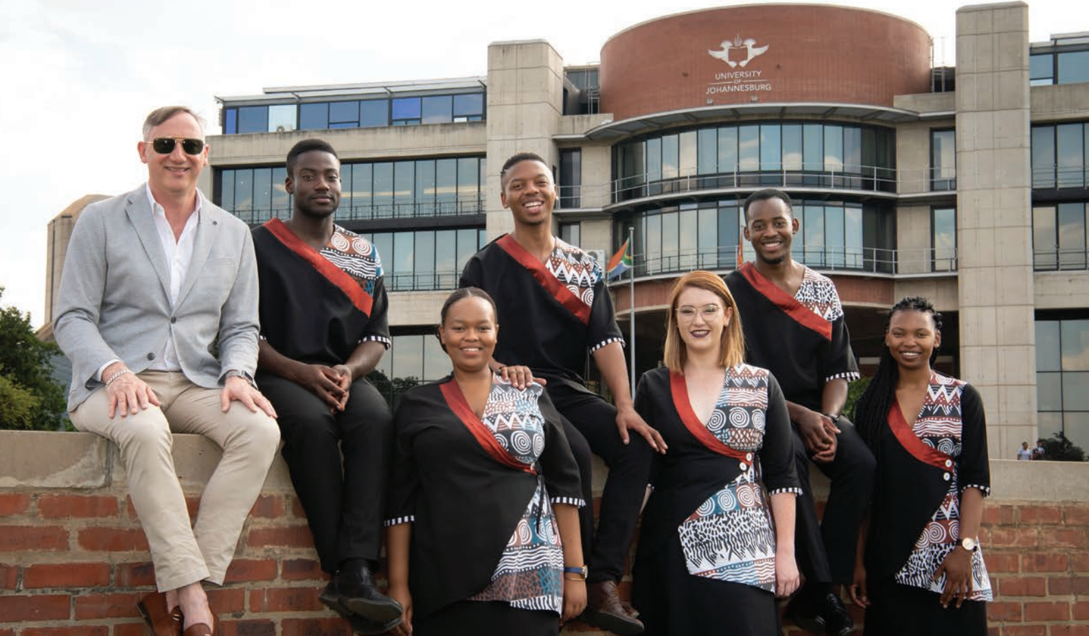
2018 UJ Choir members with the Executive Dean of FADA, Prof Freschi

more than just an ensemble; it is a living testament to the transformative power of music and leadership. The choir's history, marked by the vision and dedication of its conductors, illustrates how music can bridge gaps, connect people across boundaries, and foster a sense of unity and belonging. The UJ Choir's legacy is a celebration of its journey through time,