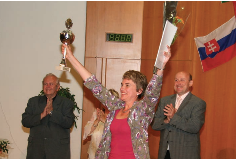
UJ Choir's victory in Pardubice 2008