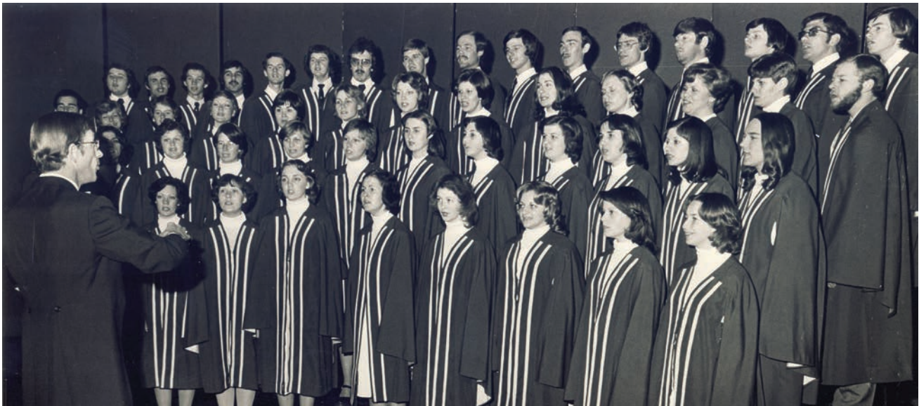
RAU Choir 1977