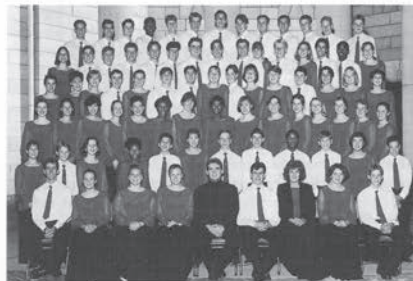
East Rand Youth Choir