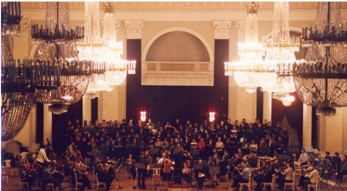
RAU Choir rehearsals of Mozart's Requiem in Luxembourg and St. Petersburg 2003