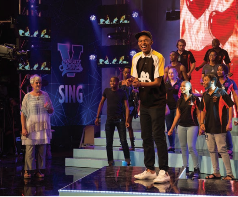
Varsity Sing rehearsal 2016

In 2016, the choir impressed South African audiences with a diverse program and secured second place in the popular choir competition, Varsity Sing! on KykNet.