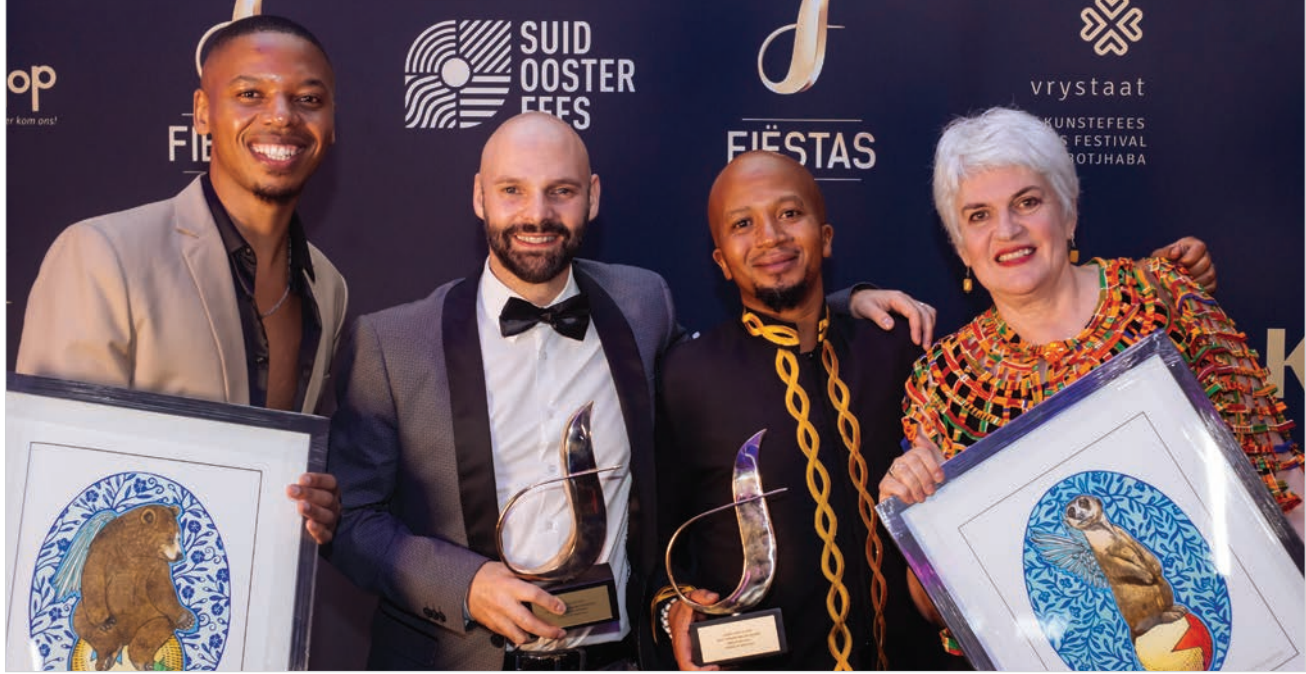
Echoes of Heritage win at the KykNet Fiëstas 2023