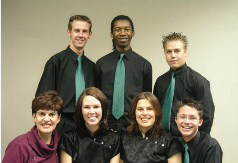
RAU Choir Committee 2004