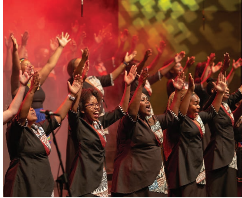
World Choir Games 2018