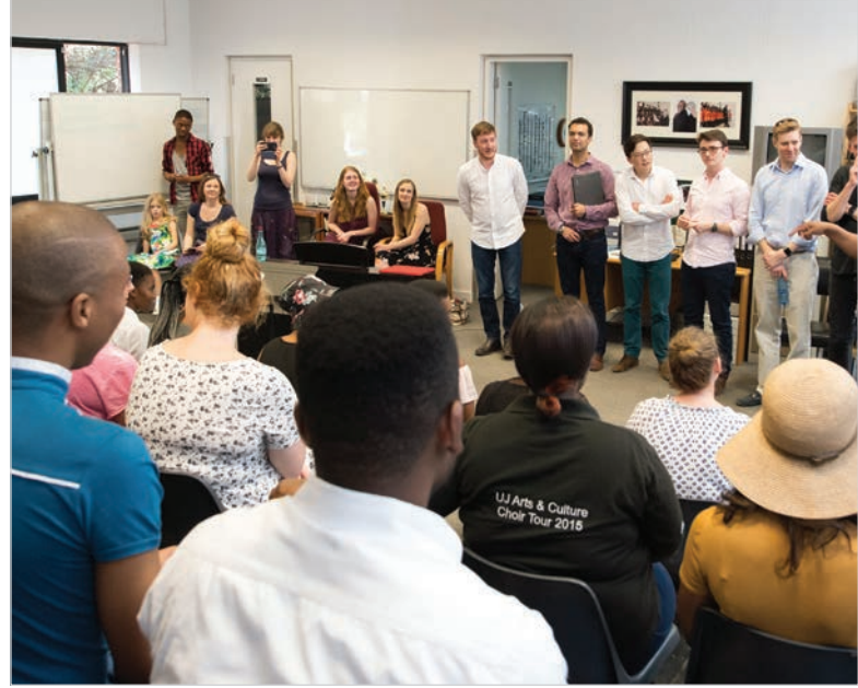
UJ Choir with The King's Singers 2017

In 2018, the UJ Choir won two gold medals at the World Choir Games in Tshwane: third place in the Mixed Choirs category with 85%, and first place in the Folk Music