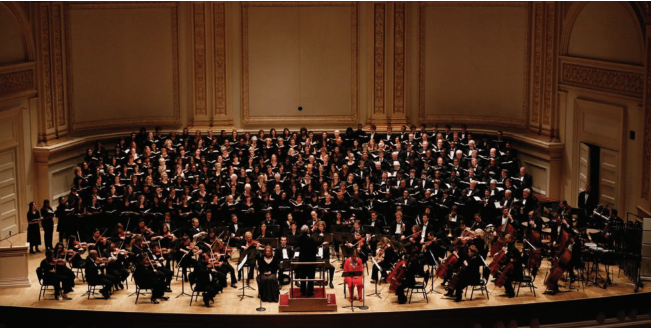
Performance in Carnegie Hall 2011