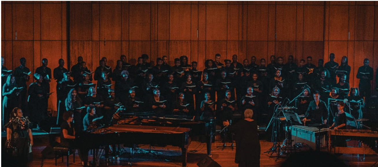
The New Covenant performance at the Linder Auditorium 2023