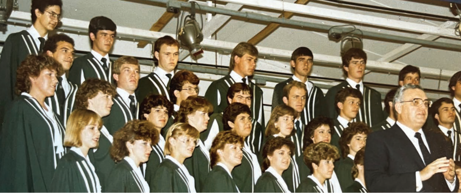
RAU choir performance in Nelspruit 1986