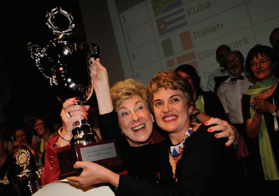
UJ Choir's win in Miltenberg 2008