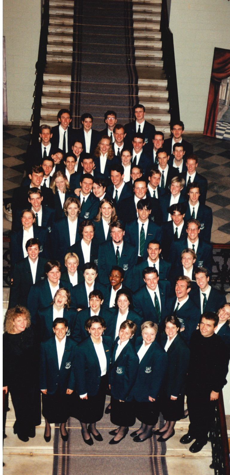
RAU Choir in Moscow 1998

manifesting as an intrinsic energy force within the people. This energy is conveyed and shared by the choir among themselves and with their audience through their singing. Even his youth choir, he notes, despite not understanding a word of the Zulu language, is deeply moved by the profound messages in South African songs.