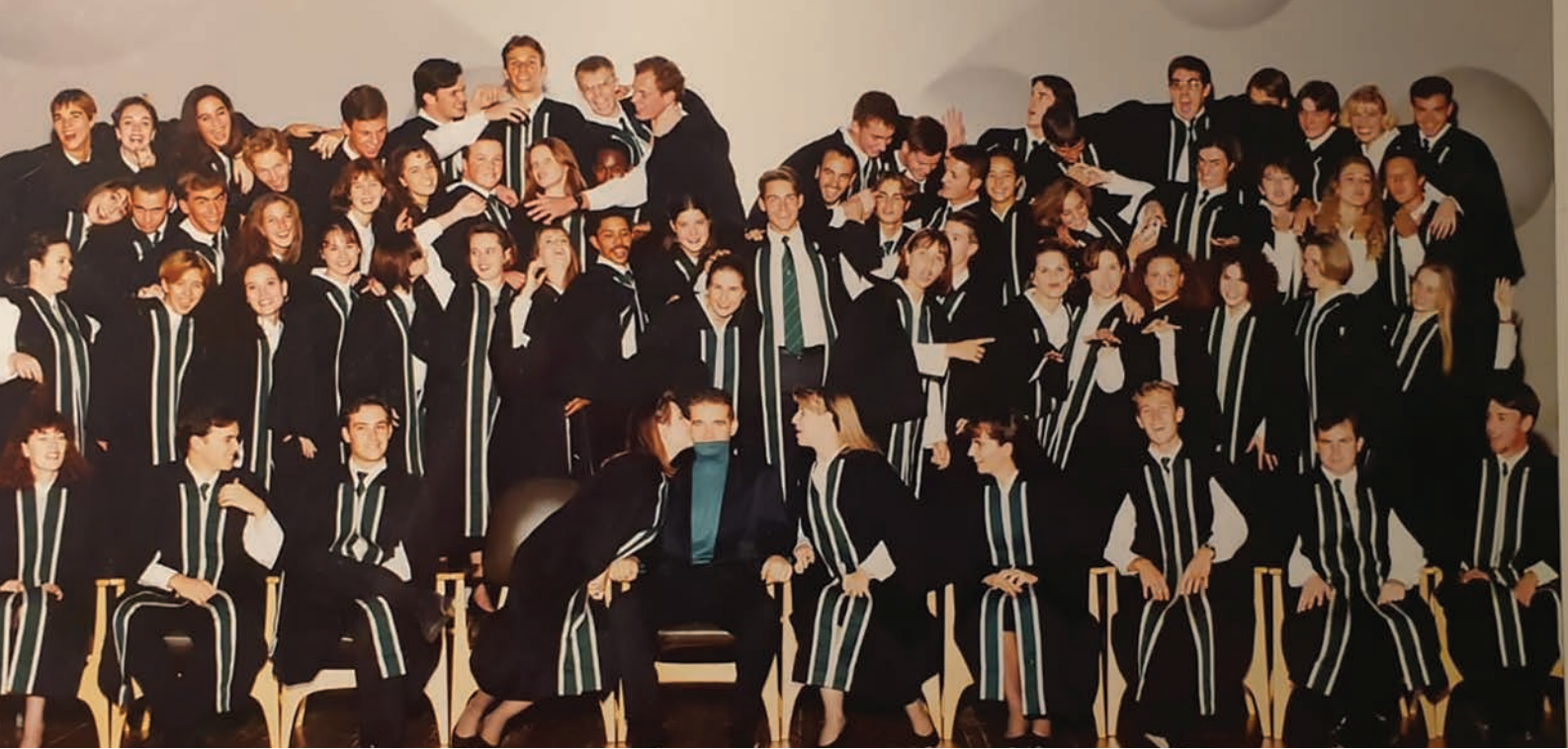
The RAU Choir share a lighter moment 1996

heard in the sound of the choirs; and when they come here, it's a message that's so strong because of the South African spirit that's being transmitted."