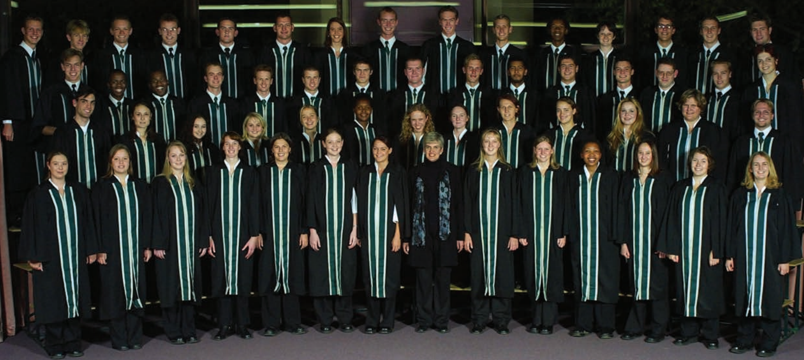
RAU Choir 2001

The year 2003 was particularly memorable in the choir's history. They embarked on an international tour to Central Europe, Finland, and Russia, with notable performances of Mozart's Requiem in Luxembourg and St. Petersburg, alongside the University of St. Petersburg Choir.