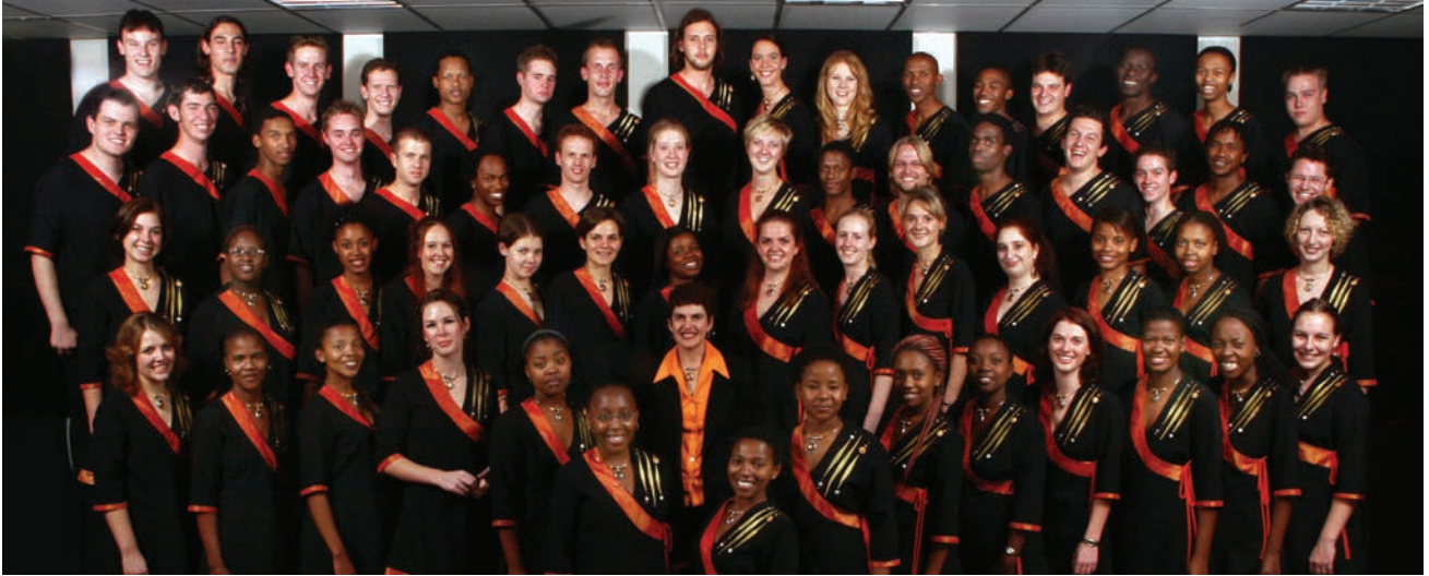
The first UJ Choir after the merger 2005