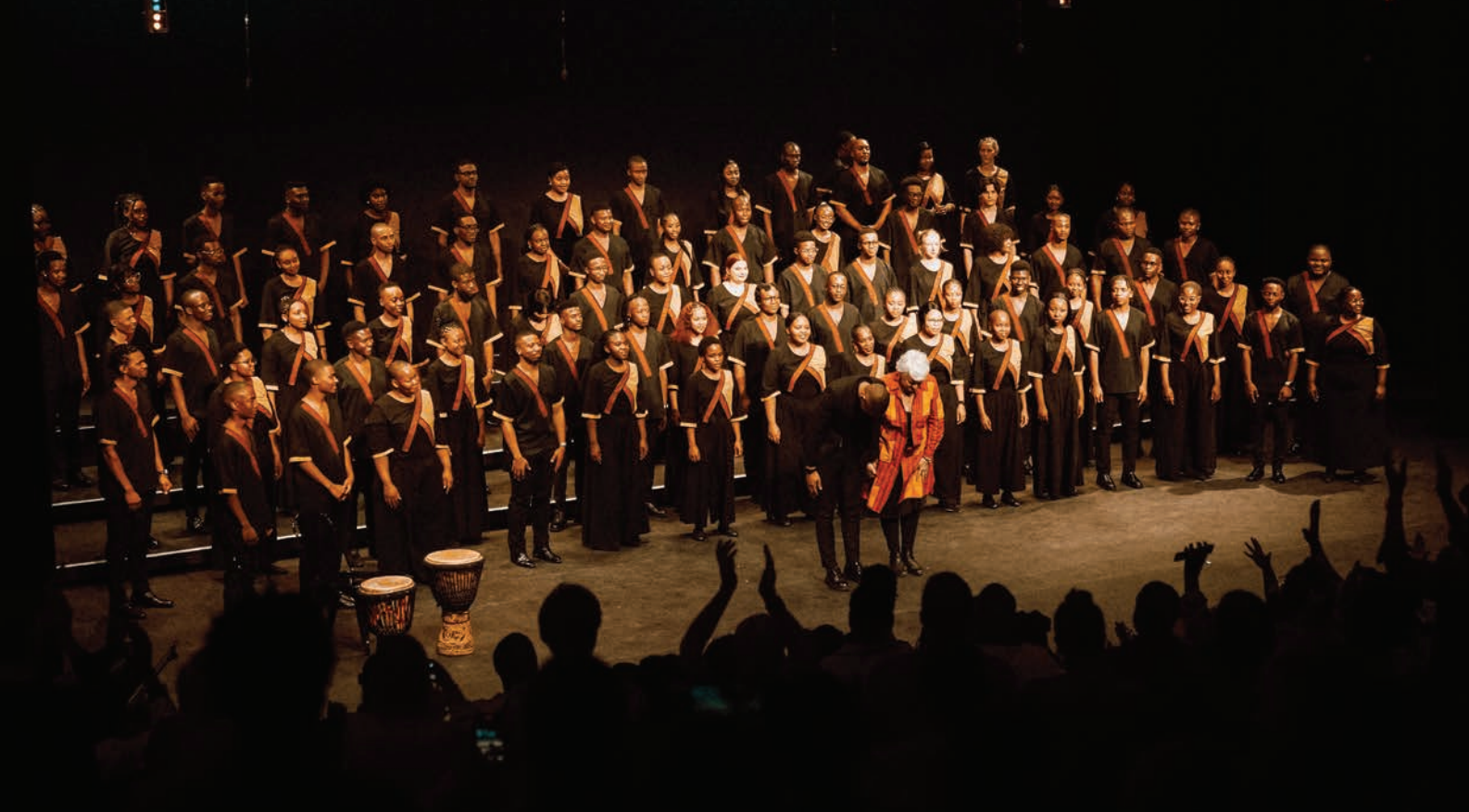
UJ Choir 'Sounds of Democracy' concert