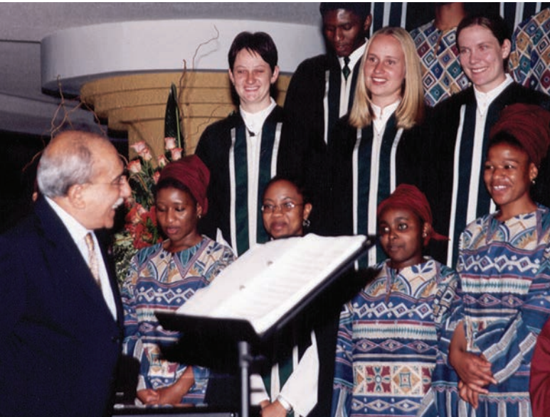
RAU Choir & RAU Chorale joining during Kader Asmal's visit