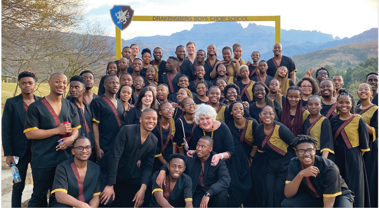
UJ Choir at the Drakensberg Boys' School