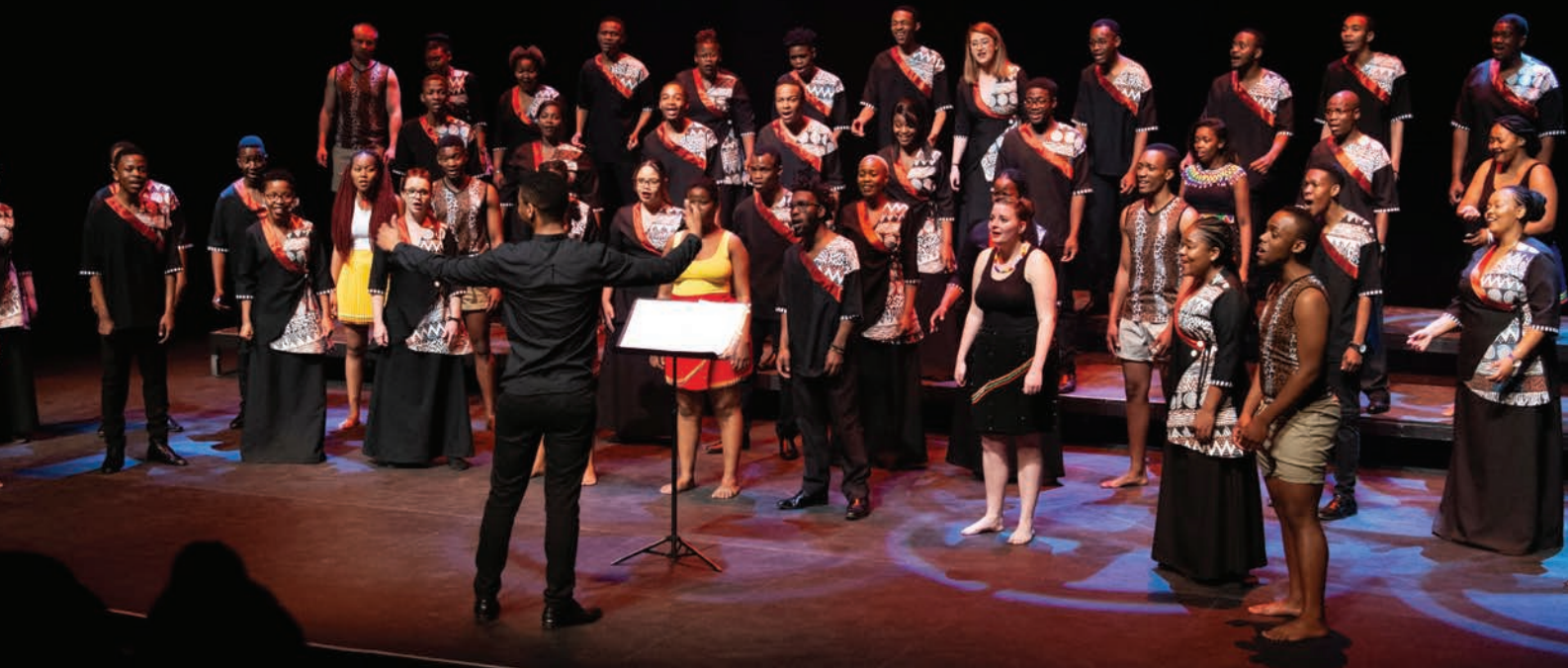
UJ Choir Lunch Hour Concert 2018

Having been conducted by women throughout his musical career, he attributes much of his development as a conductor to the nurturing and motherly guidance he received.