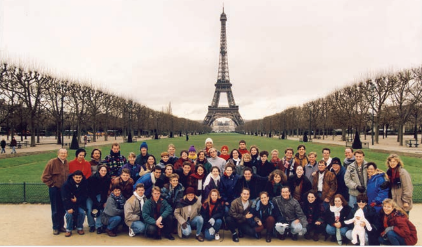
RAU Choir in Paris on tour, January 1995