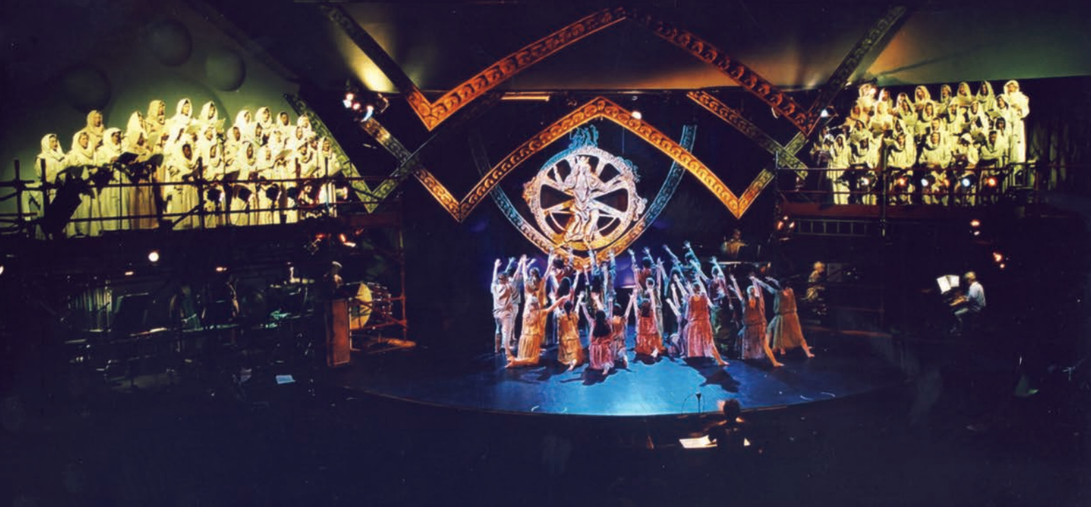
Performance of Carmina Burana 2002