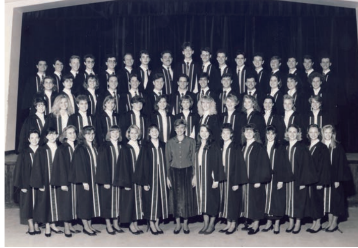
RAU Choir 1992