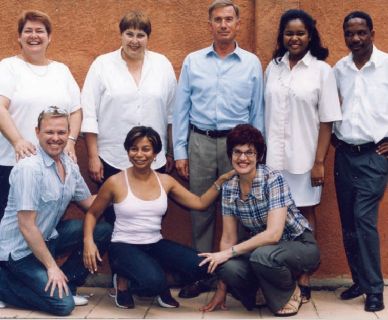
RAU Cultural office staff members 2001