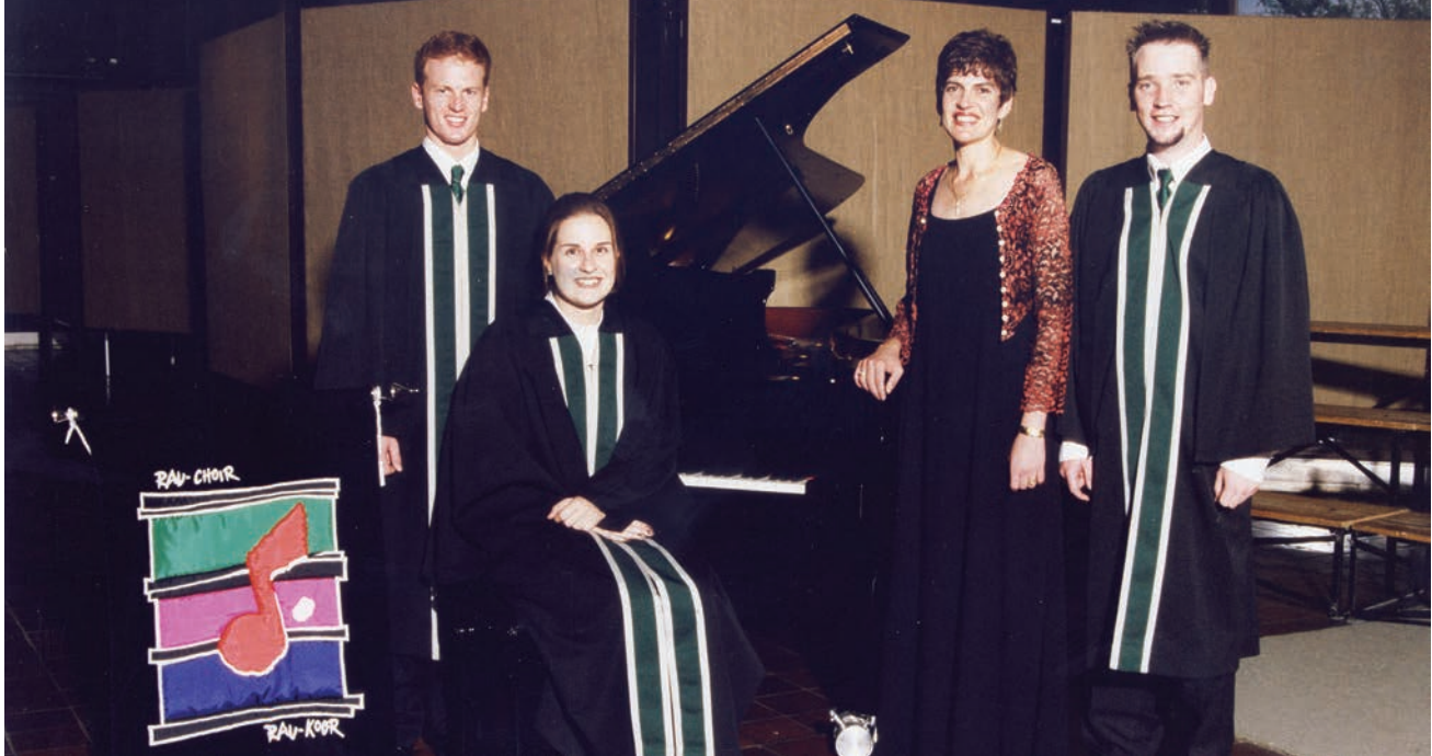
RAU Choir Committee 1999