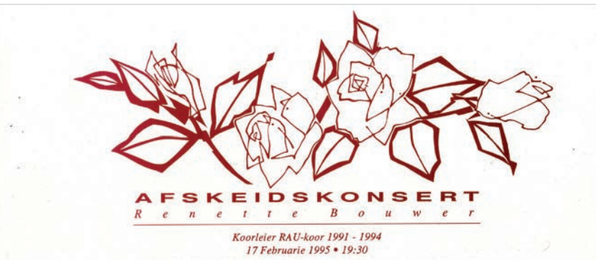
Renette Bouwer's farewell concert