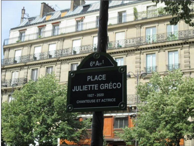
Figure 1: A square in Paris named after the French singer and actress Juliette Greco