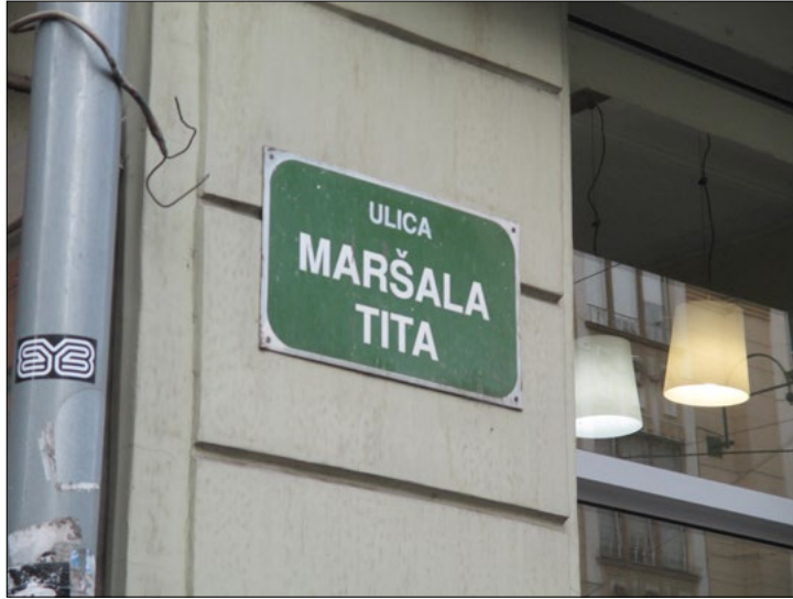
Figure 3: A main business street in Sarajevo, Bosnia and Herzegovina, named after the president of former Yugoslavia, Josip Broz, commonly known as Tito. The name was not replaced despite a basic political regime change.

It is also true that commemorative names have an orientational function (they appear on the mental map just like descriptive and neutral names), but certainly less so than descriptive names, which may point in a certain direction, describe the location within the place (e.g., Main Square ), establish a temporal ( New Market ) or size relation ( Broadway ), or indicate the historical ( Baker Street ) or current ( Airport Drive ) function of a traffic area.