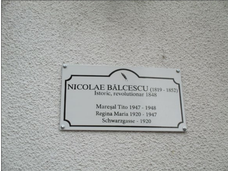
Figure 4: The name of the main business street of Brașov/Brassó/Kronstadt in Romania has undergone three changes since 1920, with the former names still being listed on the name plate as a kind of historical lesson

Sometimes squares, parks, and streets are even divided into sub-units to find an appropriate place for a prominent name. In any case, commemorative names lead city administrations from one dilemma to another, and many certainly wish that Pandora's box had never been opened. Surviving relatives of the deceased, associations, and other lobbies to which the deceased was affiliated, also political parties, present their demands and exert pressure on administrators.