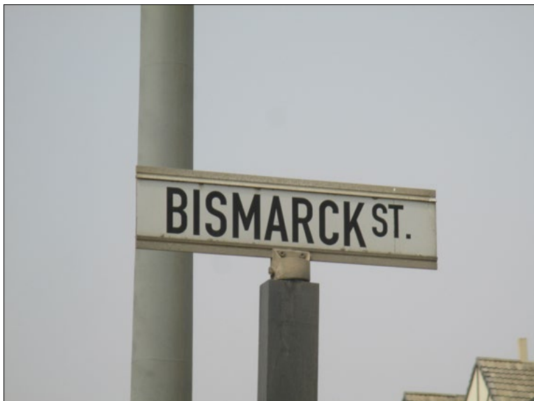
Figure 2: A street in Windhoek, Namibia, the former German colony Southwest Africa, named after Otto von Bismarck, the first chancellor (1871–1890) of the German Reich